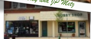
Dad's Toy Shop